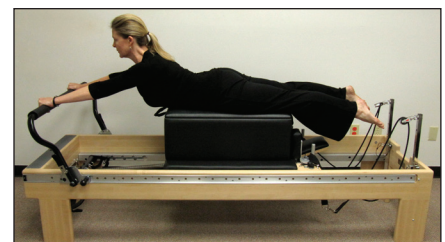
FIGURE 3. Prone spine extension on the Pilates Reformer.

The physical examination included measurement of lumbar spine range of motion (ROM) and total trunk flexion ROM using an inclinometer. 77 Aberrant motions during lumbar ROM were noted, including instability catch, 57 painful arc of motion, 22 Gowers' sign, or a reversal of lumbopelvic rhythm. 23 Supine straight leg raise and prone hip rotation ROM were measured using a single inclinometer. 77 Generalized ligamentous laxity was assessed on a 9-point scale described by Beighton and Horan. 8 Two special tests