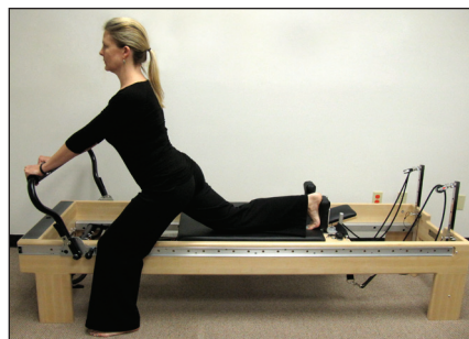
FIGURE 2. Standing hip extension on the Pilates Reformer.

and 10 representing emergency-room pain. The subjects also completed a pain diagram and the Fear-Avoidance Belief Questionnaire (FABQ). The FABQ has 2 subscales that measure fear-avoidance beliefs about work (7-item scale) and physical activity (4-item scale). The ODQ assesses disability related to LBP. The ODQ was administered at baseline and after 8 weeks of treatment, and served as the reference standard for determining the success of the treatment program. The health history intake included questions concerning mechanism of injury, nature of current symptoms, and prior episodes of LBP. Subjects were also asked about the distribution of symptoms for their current episode.